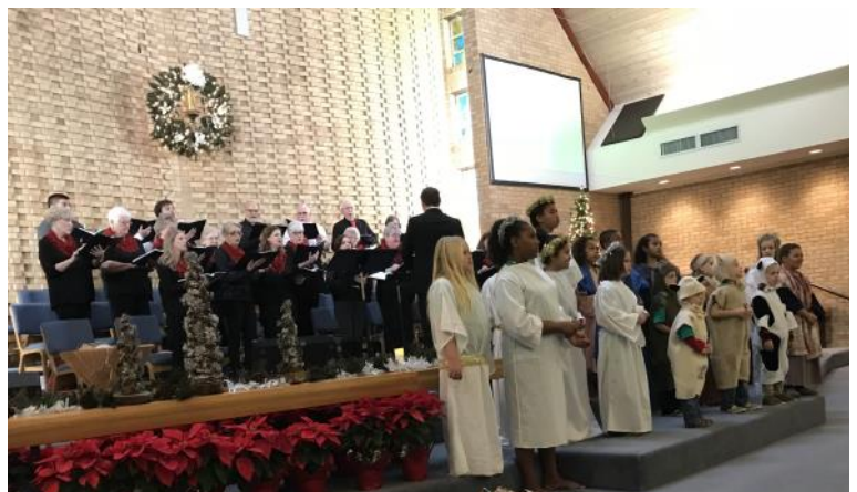
The Wesley Chancel Choir and Student Ministries presented BORN IS THE KING on Sunday,