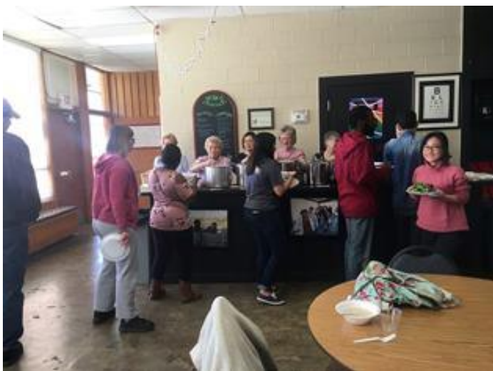
United Methodist Women took lunch to the students at the Wesleyan Campus Ministry - Texas A&M-Commerce February 15, 2017