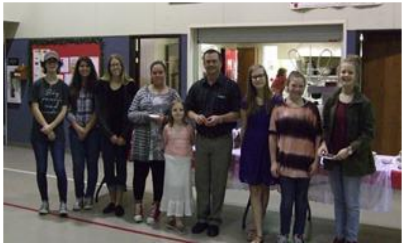
The youth did a great job of serving lunch on Sunday, February 12. (Thanks also, helpers!)