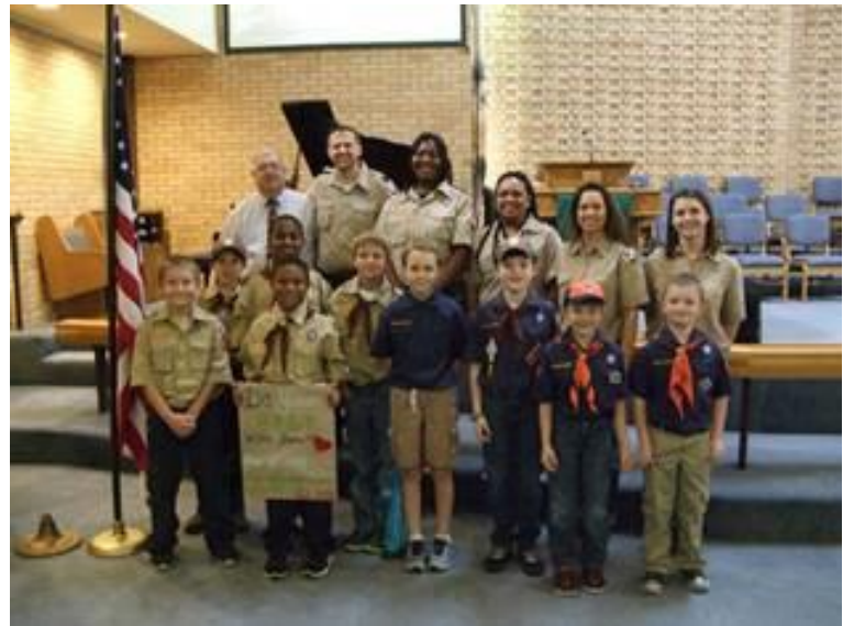
Scouts and leaders from Troop 77 participated in the worship service, Sunday, February 12.

For more information, talk to an Emmaus alumni.