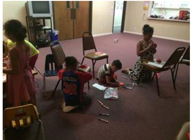
The children made Valentine cards for the Holy Highway girls.