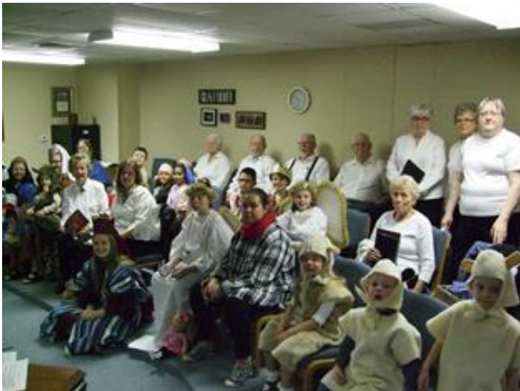
On Christmas Eve the children, youth and Chancel Choir presented The Christmas Story