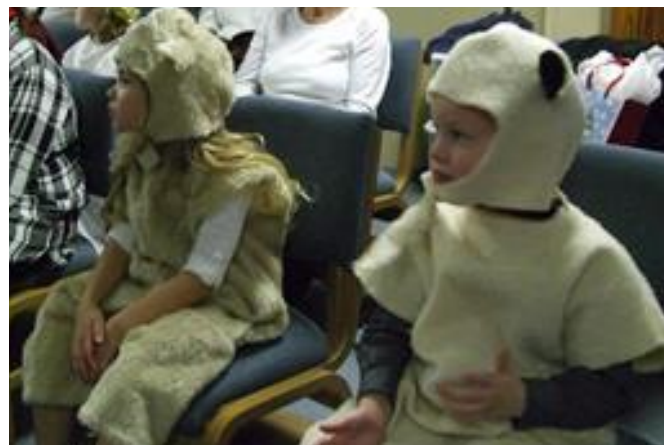
The Children, Youth and Chancel Choir presented The Christmas Story on Christmas Eve.