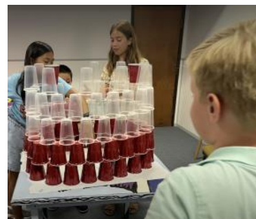
Children in Sunday school class about ready to walk around the walls of Jericho.