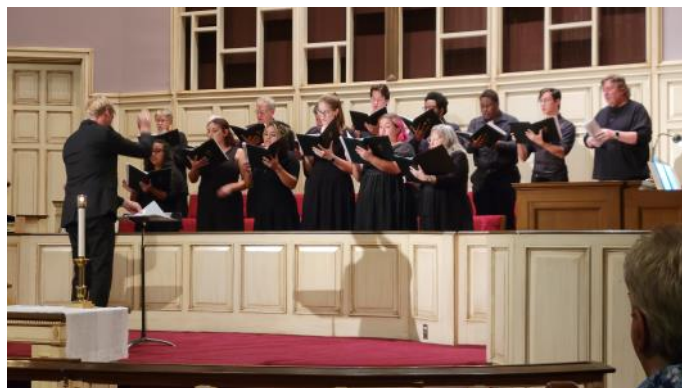
The Kavanaugh UMC Choir