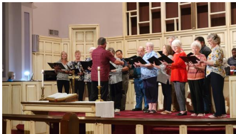
The Wesley Chancel Choir sang at Kavanaugh UMC, Greenville, on October 23 at the fundraiser for the summer mission trip to the Philippines and KUMC singer scholarships.