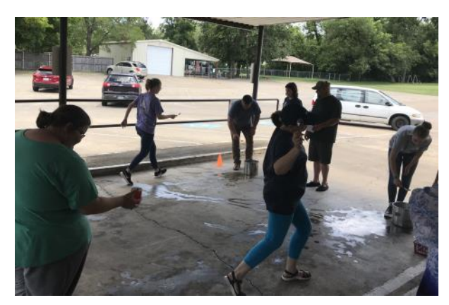
Life isn't always fair... even the adults were reminded to that when the teams had different cups in the relay race.

Making GUTSY bears: God's Unique Talented Special You!