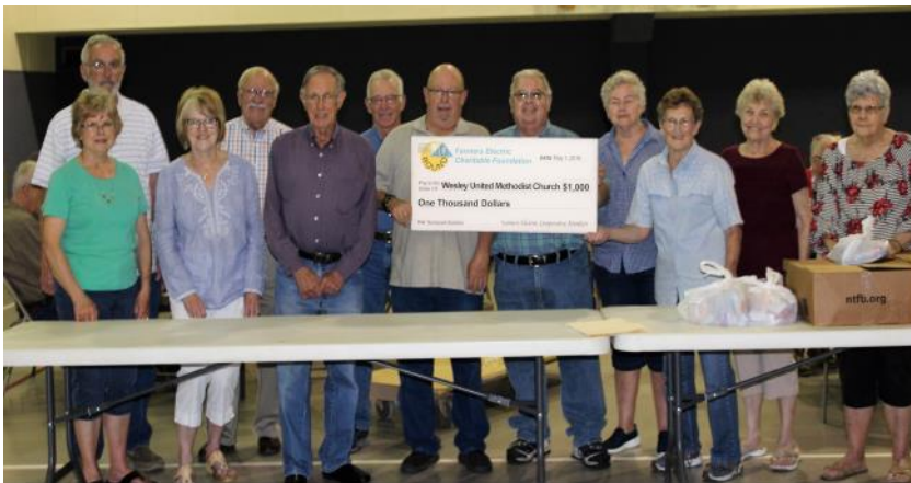
Farmers Electric Coop gave a very generous grant for $1000.00 to Backpack Buddies