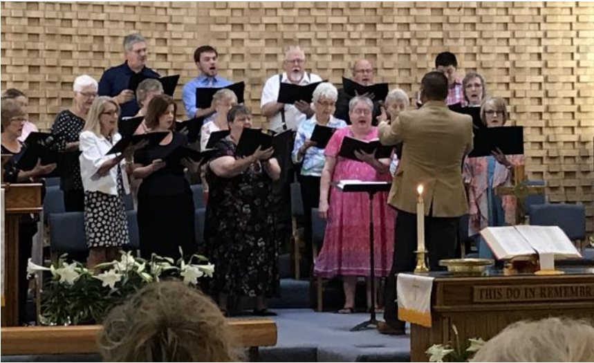
The Wesley Chancel Choir presented Behold the Lamb on Easter Sunday.