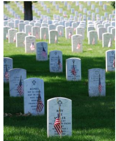
Graves at Arlington National Cemetery are decorated with flags for Memorial Day.

Memorial Day (or Decoration Day) is a federal holiday in the United States for remembering and honoring persons who have died while serving in the United States Armed Forces . The holiday, which is currently observed every year on the last Monday of May, was most recently held on May 28, 2018. Memorial Day was previously observed on May 30 from 1868 to 1970. (Wikipedia)