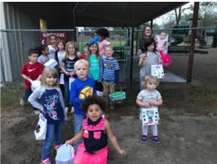
Easter Egg Hunt, March 28, 2018