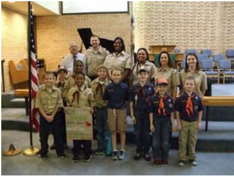
couts and leaders from Troop 77 participated in the worship service, Sunday, February 12.

For more information, talk to an Emmaus alumni.