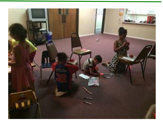
The children made Valentine cards for the Holy Highway girls.