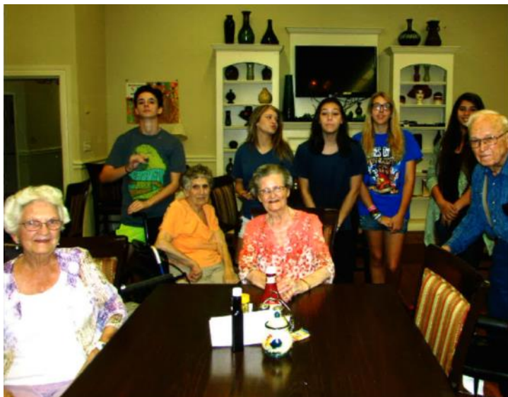
The Wesley Youth sing the second Tuesday of the month at Wesley House.